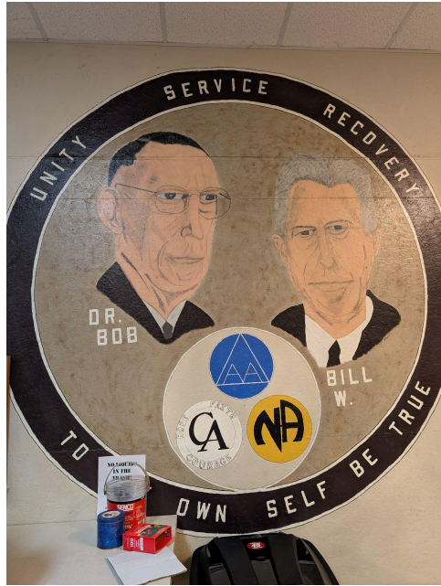
Mural at Defiance Fellowship Club

14 members of Area 55 joined for an outreach trip to Districts 8, 9, and 11. We were able to be present at someone's first ever A.A. meeting to help the group's members carry our life saving message.